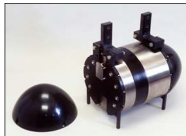
Option 034: Mounting Plate Assembly